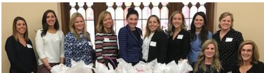
Hope Tour with the Women's Initiative of Halloran & Sage