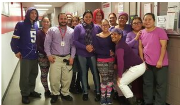
Our awesome friends from Rich Foods raising awareness!