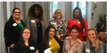
Our amazing partners from Bank of America & the CT Global Tech & Operations Team