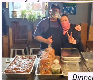
Dinner & Grocery Deliveries