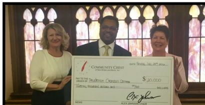
Community Chest of New Britain & Berlin provides vital funding for our DV education & prevention programs.