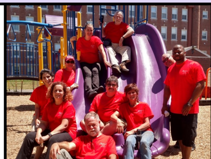
Our friends at Liberty Bank donated their time to beautify the playground at Rose Hill. They were committed to making sure our kids had a safe place to play all summer long.