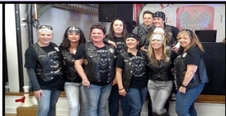
The Twisted Sisters MC annual breakfast had a sell-out crowd, raising over $3,600 to support PCC and educate others about domestic violence.