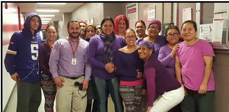
The staff of Rich's in New Britain held a “Dress Down & Go Purple” day last October — and raised over $1,500 to support PCC and our families!

Visit our website, PrudenceCrandall.org , to view our Domestic Violence Awareness Month activities.