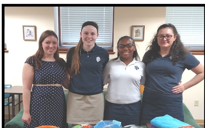
The students at St. Paul Catholic High School in Bristol ran a fundraiser to collect summer items for our residents.