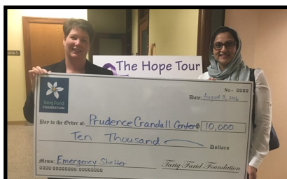
The Tariq Farid Foundation’s generous grant will support our emergency shelter for victims and their children.