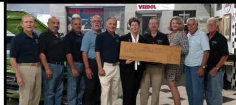
The Good Old Boys have raised over $27,000 in the past five years to provide safety, healing, and hope for victims of domestic violence.